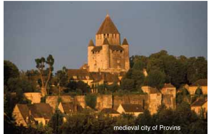
medieval city of Provins